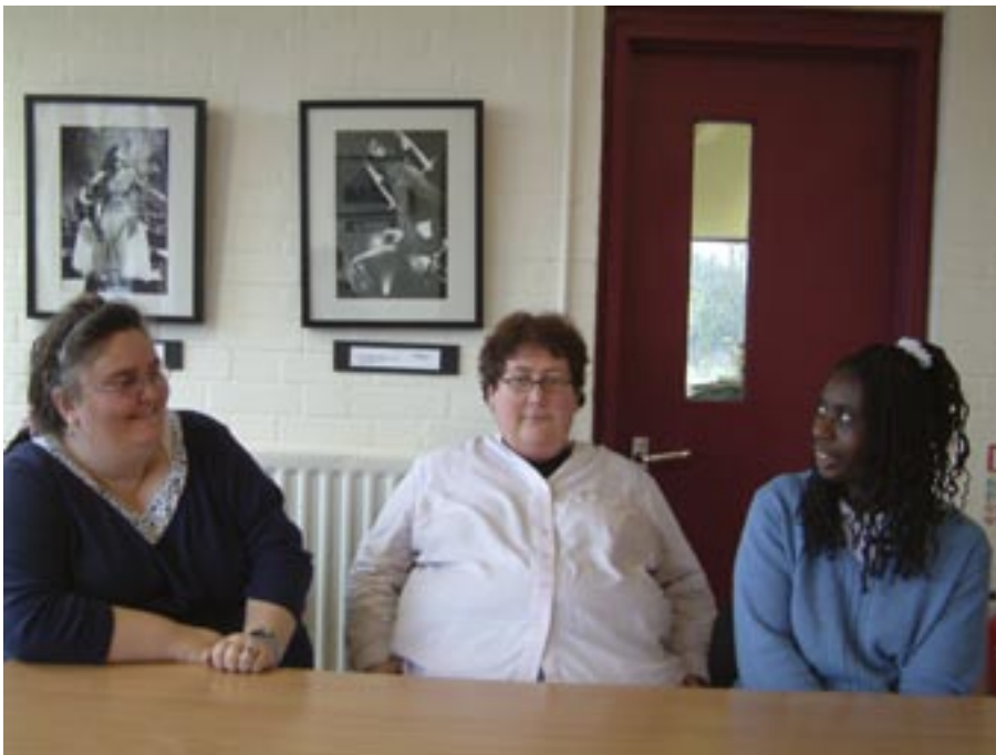
She is part of a women's group there.